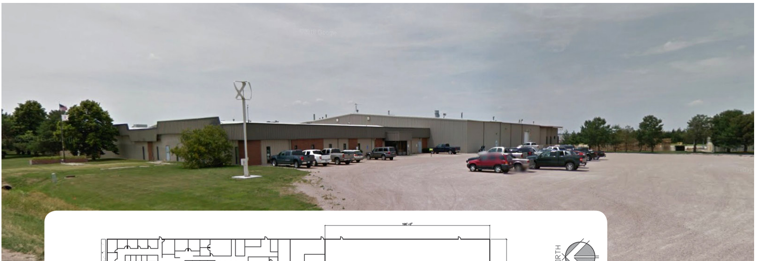
← Floor Plan