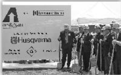
Photo: Ground breaking on June 14, 2004

A ground breaking ceremony was held June 14th for Husqvarna Turf Care Company's 274,000 square foot building on 25 acres near the Beatrice Municipal Airport. This building